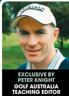
EXCLUSIVE BY PETER KNIGHT GOLF AUSTRALIA TEACHING EDITOR